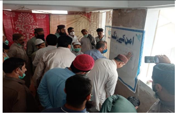
KCD146- Social Action Project (Community Level)