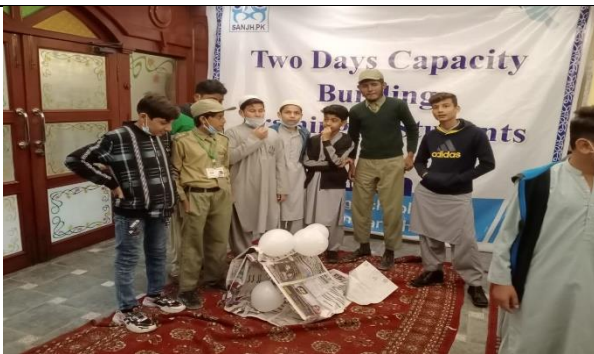
KCD146-Group Activity, CVE Training Session of Students