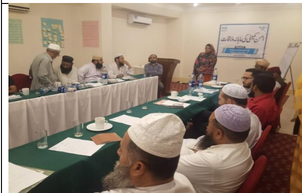
KCD146-Committee Members Meetings