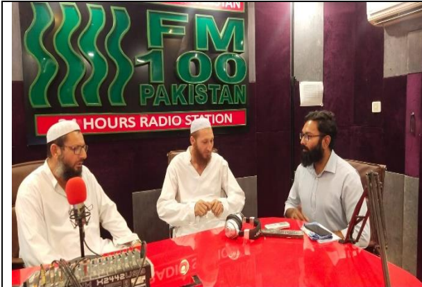
KCD146- Radio Show