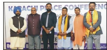
2 nd Press Released

امن و رواداری اور تسلی ہم آہنگی کے فروغ پر امن کراچی کا انٹرسیکٹ پیس فورم اور امن سرگرمیوں کی بات چیت کی گئی۔ سرگرمیوں کے فروغ کے لئے سماجیہ پاکستان نے کراچی میں امن اور رواداری اور تسلی ہم اور امن سرگرمیوں کی بات چیت کی گئی۔ سرگرمیوں کے فروغ کے لئے سماجیہ پاکستان نے کراچی میں امن اور رواداری اور تسلی ہم اور امن سرگرمیوں کی بات چیت کی گئی۔ اس ایک روزہ کانفرنس میں مختلف مذاکرات سے تعلق رکھنے والوں نے شرکت کی کراچی (پہلو)۔ سماجیہ پاکستان اور رواداری اور تسلی ہم اور امن سرگرمیوں کی بات چیت کی گئی۔ سرگرمیوں کے فروغ کے لئے سماجیہ پاکستان نے کراچی میں امن اور رواداری اور تسلی ہم اور امن سرگرمیوں کی بات چیت کی گئی۔