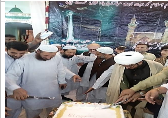
Unrestrained Transformation of Conscience of Mufti Abdul Ghafoor