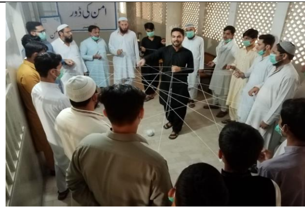
KCD146-Social Action Project (Community Level)