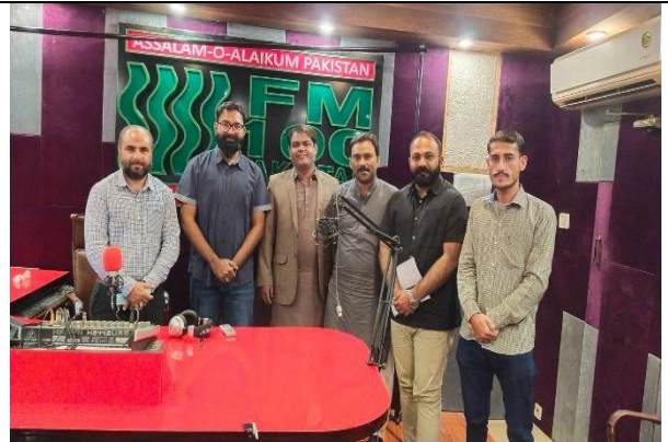
KCD146- Radio Show