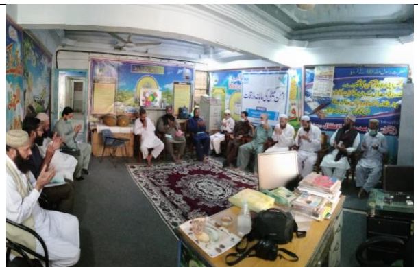
KCD146-Committee members meeting