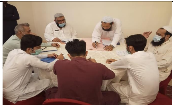
KCD146- 3 rd CVE Training, Participants views about peace