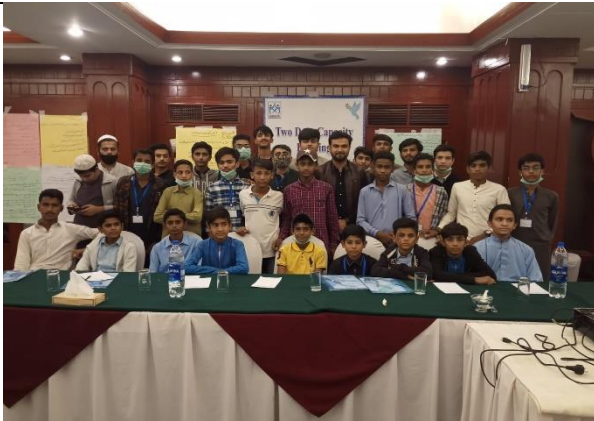
KCD146-CVE Training Session of Students