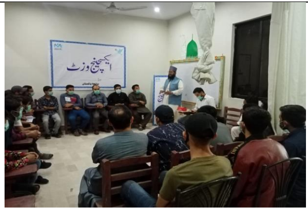
KCD146-Social Action Project (Community Level)