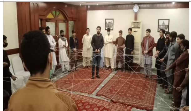
KCD146-Geoup Activity, CVE Training Session of Students