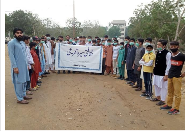
KCD146-Diversity Tour / Exposure visit