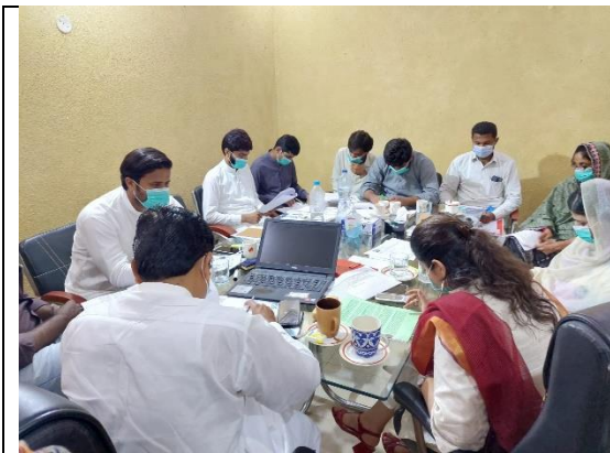
Caption: (Staff Orientation Workshop)