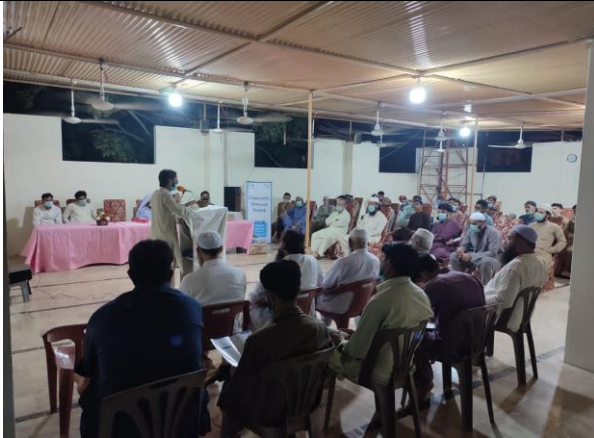
KCD 146-Community outreach session