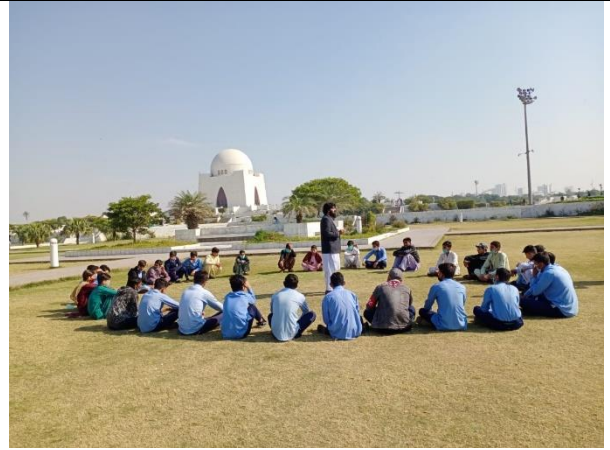
KCD146-Diversity Tour / Exposure visit