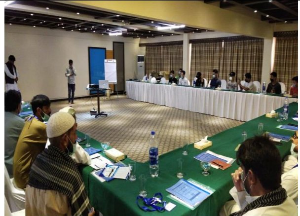
KCD146-1 st CVE Training Session