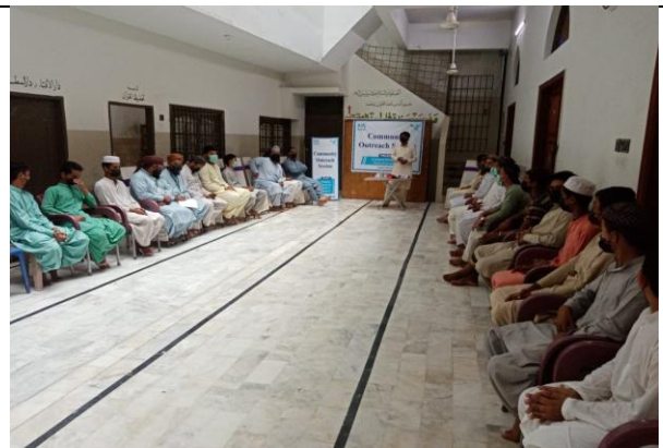
Community outreach Session Mark e Atfal Gulzar hijri