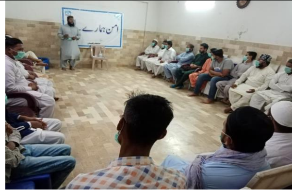
KCD146-Social Action Project (Community Level)