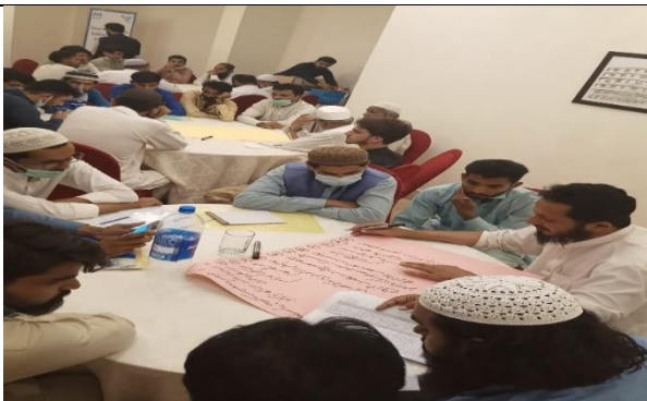
KCD146- 2 nd CVE Training, Group Activity for collecting views of participants on Peace