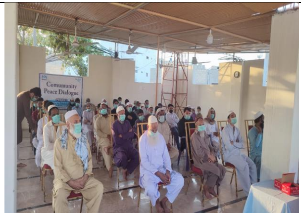
KCD146-Community Peace Dialogue