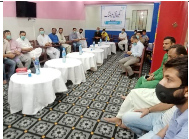
KCD146- Corner / Community Meetings