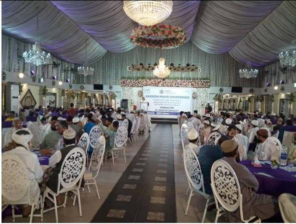
Karachi Peace Conference