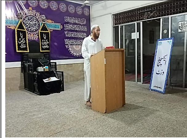
Qari Mushtaq Succeeded to Unmask the Fabricated Religious Myths Against Opposite Sect