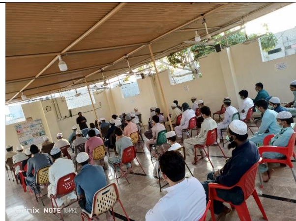
KCD146-Community Peace Dialogue