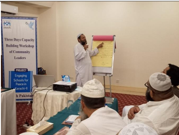
KCD146- 4 th CVE Training, Participant sharing their views about peace