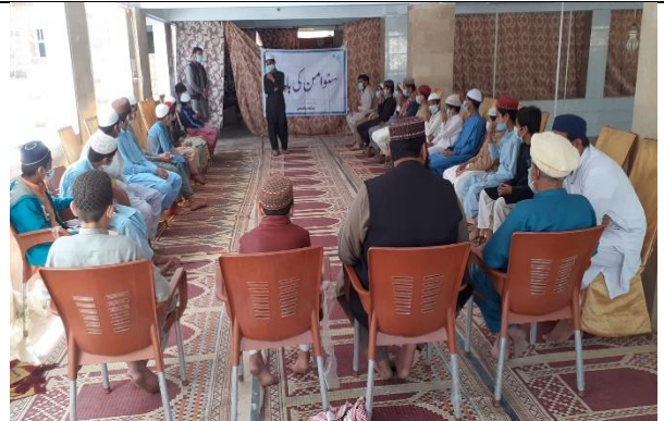
KCD146-Social Action Project of Students