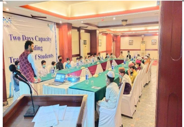
KCD146-CVE Training Session of Students