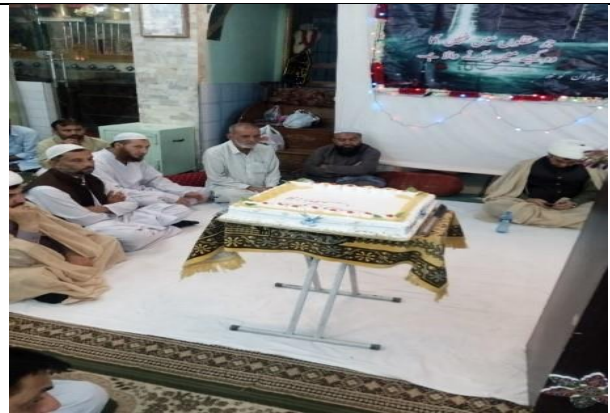
Unrestrained Transformation of Conscience of Mufti Abdul Ghafoor