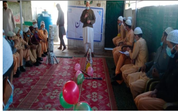
KCD146-Social Action Project of Students