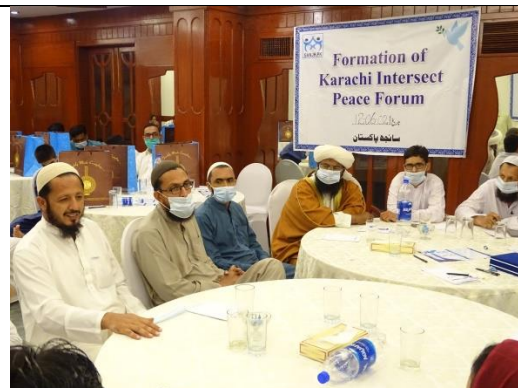
Caption: Formation of Karachi Intersect Peace Forum

7) Please indicate your level of satisfaction with the DAI processes in implementing this grant: