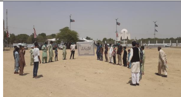
Caption: Diversity Tour