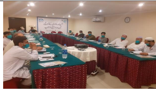
Caption: CVE Training Session of Teachers