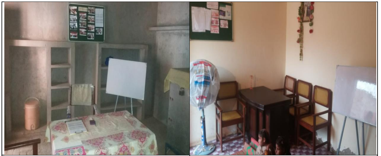
Madrasa Ghosia Taleem-ul-Quran' peace Peace Center of Madrasa Bibi Zainab Pak center

Sanjh Pakistan established 12 peace centers, 1 in each madrasa. They distributed the material for the establishment of peace centers. The space for peace centers was provided by female madaris' management.